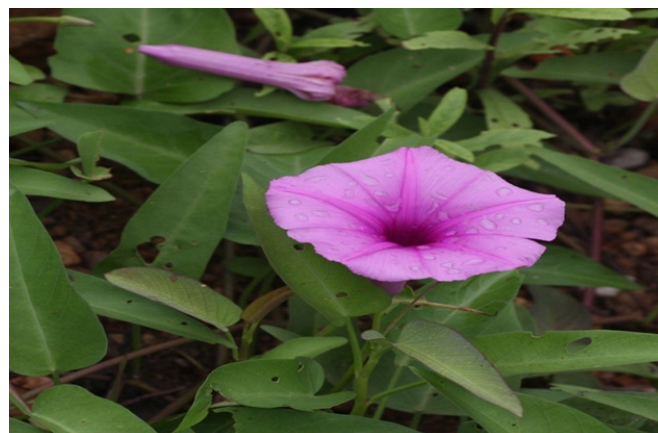
Figure 1 Photograph of Ipomoea aquatica .

The water and marsh plant, Ipomoea aquatic (Figure 1) used for this study has a creeping hollow filled stems with shining green leaves. Its stems are 2-3 meters or longer, and rooting at the nodes. The big funnel shaped flowers, 2-5cm are purple or white. It is a plant trailing or floating, herbaceous, sometimes annual or perennial. Propagation is either by planting cuttings of stem shoots that will root along the nodes or planting seeds from flowers that produce seed pods. It is found throughout the tropical and subtropical regions of the world. It is known by many names, which includes water spinach, river spinach etc. 21